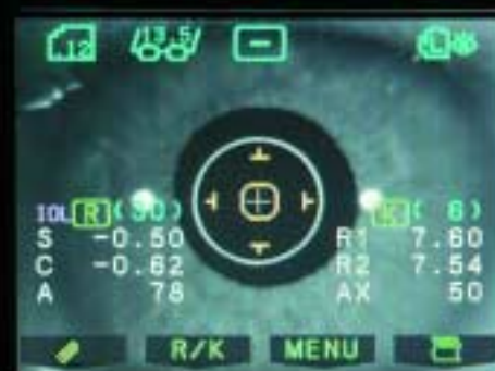
Measurement Screen when IOL mode is set