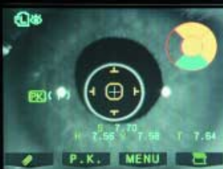
Kerato-Peripheral Measurement Screen