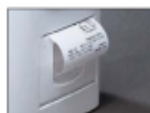
Illustration of Axis & PD helps customers to understand the data better.

Print paper can easily be changed with one-touch lever.